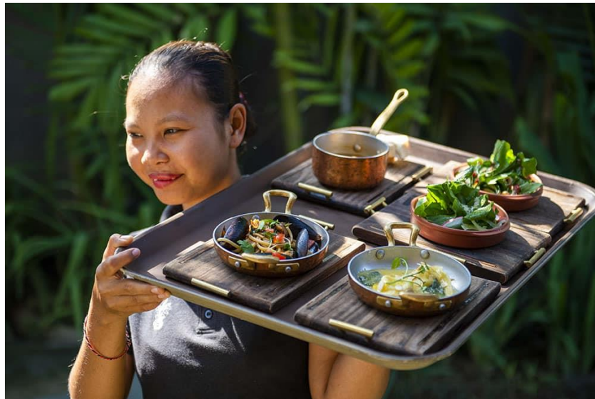
Graze all day with fabulous room service provided by Settimo Cielo.