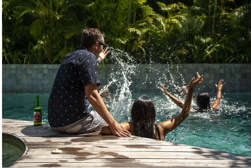
Stay and play at The Layar.