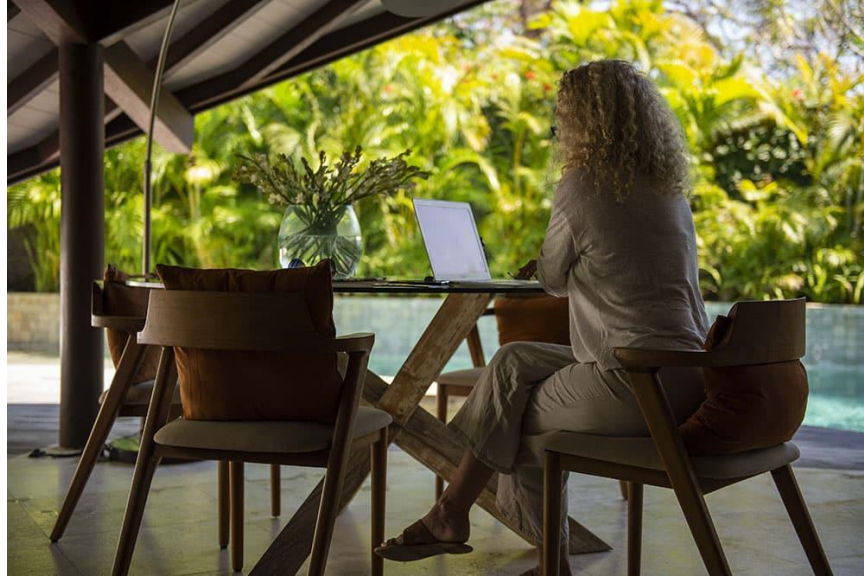
Not just another day at the office

With super-efficient wifi, parking on the premises, coffee, tea and meals on call and space to meet, greet and plan, the Layar, strategically located in central Seminyak, makes perfect sense. And when work is over, call up cocktails and chill out before heading out on the town. Strike the perfect work/play balance, The Layar is made for you.