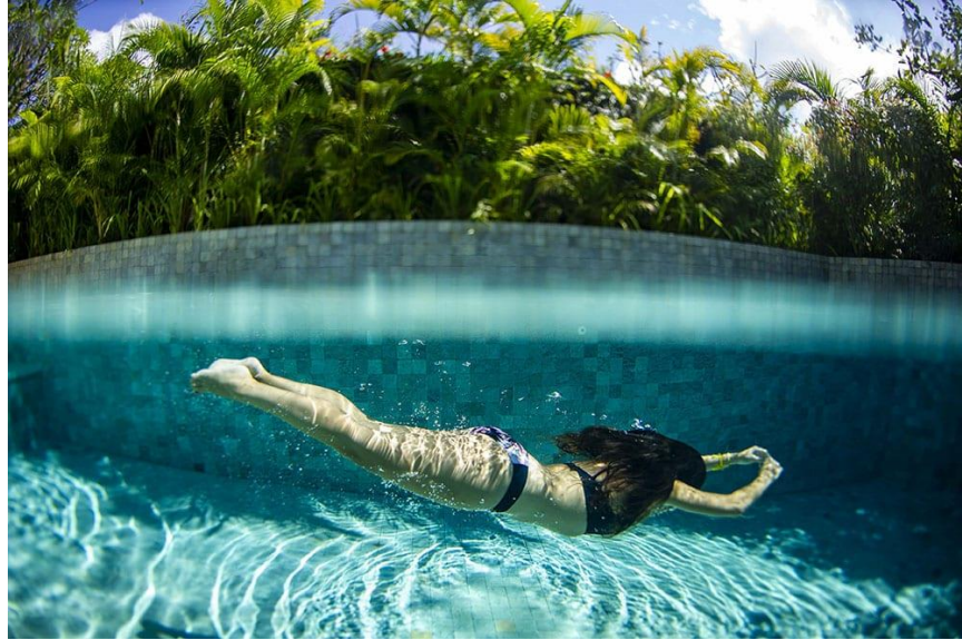
Life is better with your own private pool