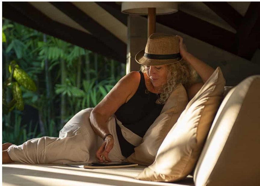
Enjoy the quiet and get some me time curled up on the overside sofas

You know the feeling: life has just got you all wound up and you need a break. All you yearn for are long, quiet days doing exactly what you want. A place where you can close the door on the noise, turn off the phone and do the things that make you happy.