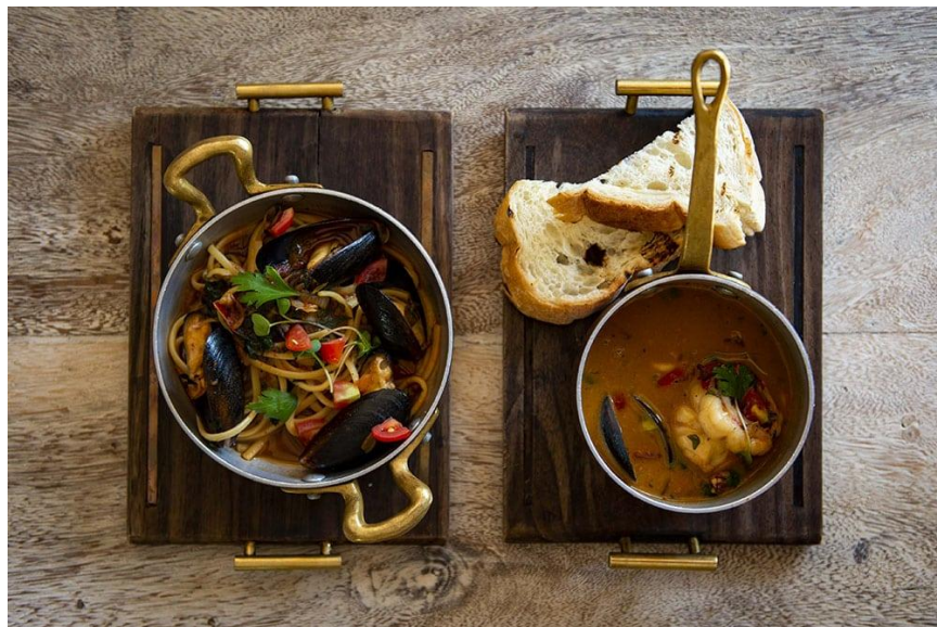
Feed the soul and the appetite with room service from Settimo Cielo.

With super-efficient wifi, parking on the premises, coffee, tea and meals on call and space to meet, greet and plan, the Layar, strategically located in central Seminyak, makes perfect sense. And when work is over, call up cocktails and chill out before heading out on the town. Strike the perfect work/play balance, The Layar is made for you.