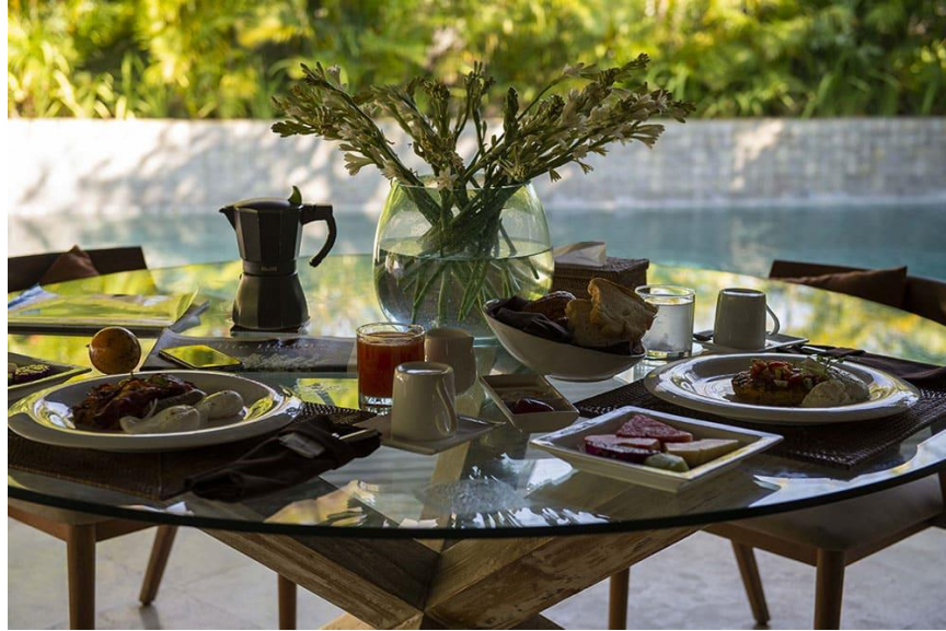
Room service breakfast is a feature guests rave about at the Layar.

Where the pampering ends, your own villa is a private sanctuary with a private pool, a romantic terrace, a luxe living room and an elegant master suite where the lights are low and the entertainment system plays your tune.