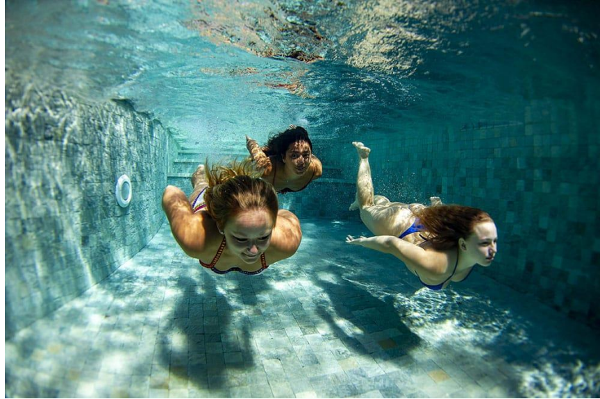
Dive in, don't wait.

There is space for everyone to play, private guest rooms with ensuite bathrooms means everyone has a private getaway while the spacious open living and dining areas and beautiful, blue pools surrounded by decks and tropical gardens means staying home is a holiday. Venture out and you have Seminyak on your doorstep with fun for everyone. Stay, play, eat, shop, spa and hit the beaches for surf and sunset. Holidays don't get much better than this.