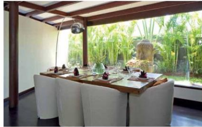
EVERYDAY LIVING A TRADITIONAL WOOD ABOUT 10-15% OF THE 4-ROOMS LIVING AREA Core of living area sofa can be used as TV room in the meantime living area The sofa logs resembling the boat hull

Conceptualized as designer villa and spa resort, The Layar that is located in 16,800-sqm land