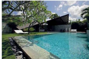
SIXTH GENERATION THE INSPIRATION FOR AN AVANT-GARDE DESIGN CONCEPT FOR USE The swimming pool Spa over bedroom Semi avant-garde concept also implemented on the bedroom

has 4 types of villa that include 1 bedroom to the largest one of 4 bedrooms. Jacuzzi only exists starting from the 2 bedrooms. Each villa in The Layar sits on a generous plot of land ranging from 500 sqm to 470 sqm, which average plot size is 600 sqm.